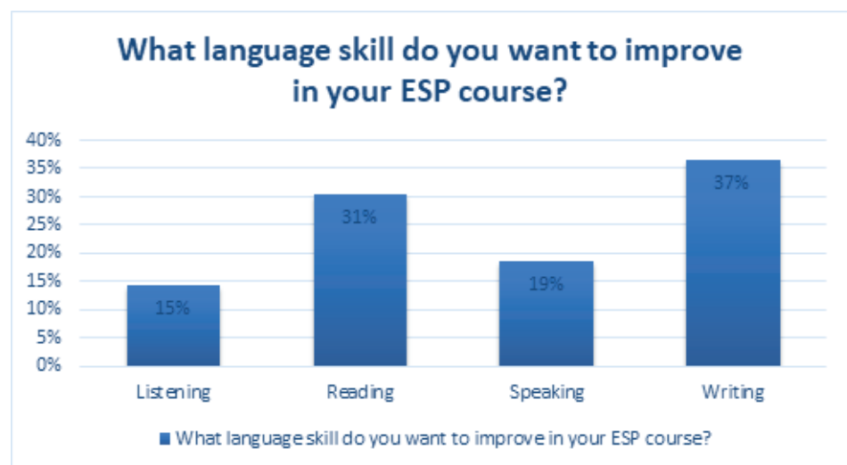
Figure 1: Learning preferences in terms of language skills

The second part of the online survey was used to retrieve information related to students' perceived language skill needs, including their perception of the current ESP course. The result of data analysis reveals that most students need reading and writing skills more than any other skills. The data gained from students' responses toward "learning preferences in terms of language skills" (Khan, 2007). In the questionnaire, the participants were asked about the language skills they want to improve during their ESP course. Figure 1 shows the students' responses towards students' needs of language skills.